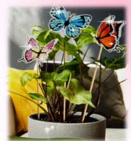
Butterfly Diamond Stakes