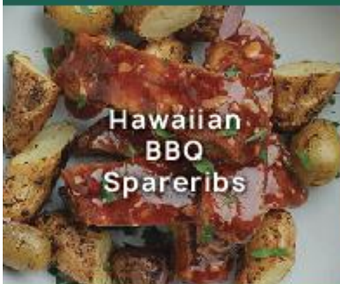
Hawaiian BBO Spareribs

The cuisine features a variety of Mediterranean & Italian dishes, each containing a range of vegetables with protein. Notable guest favorites are the fresh salads & wraps, and the healthy soups. A new menu is created every six weeks. Prepared by Zest in a Bowl and served by Age Well Senior Services.