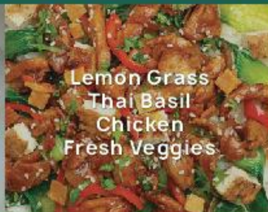
Lemon Grass Thai Basil Chicken Fresh Veggies