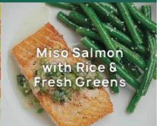
Miso Salmon with Rice & Fresh Greens

Let's do lunch! Make your reservation today.